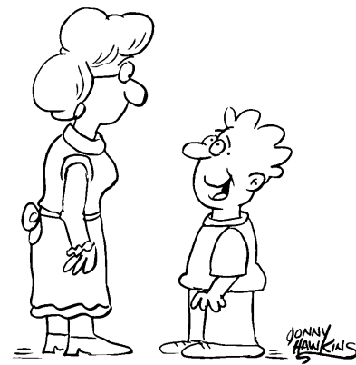
“Mom — you deserve a raise for raising me.”